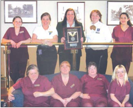
Comfort Inn Augusta