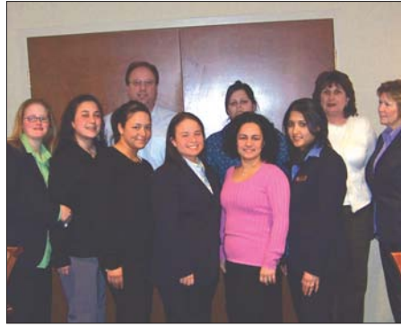
Holiday Inn Revere