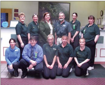
Holiday Inn Augusta