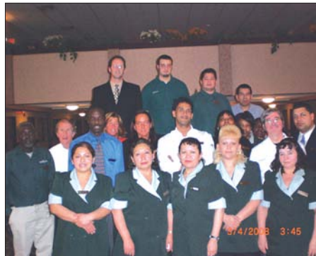
Holiday Inn Brookline

Linchris Hotel Corporation has made a major move into the urban New England market with the purchase, in partnership with Strategic Capital Partners, LLC of Chicago, of five properties from Fine Hotel Corporation of Wellesley, MA.