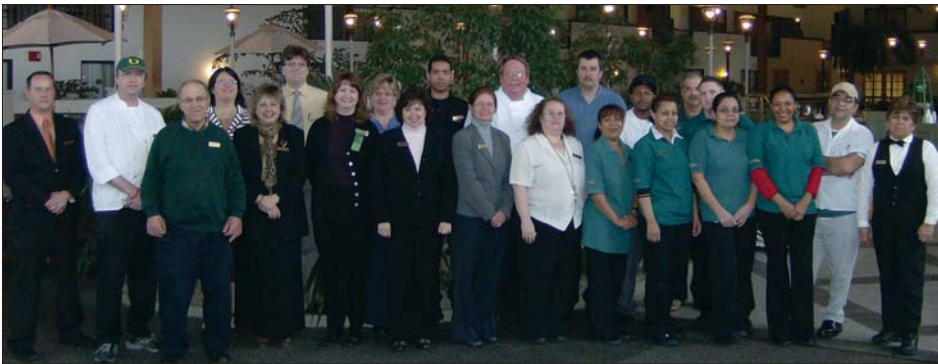
Hamton Inn Mansfield