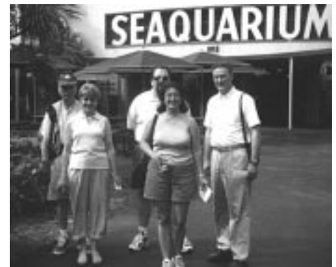
Some of our GMs enjoyed "time out" at the Miami Seaquarium.