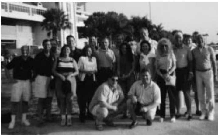
GMs gather for a group photo in front of the Pro-Player Stadium where they attended a Boston Red Sox vs. Florida Marlins game.