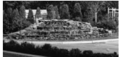
The beautiful new fountain at the Four Points Hotel, Eastham, MA, was finished September 11th. Visible from the road, it is near the hotel's outdoor pool and benches.