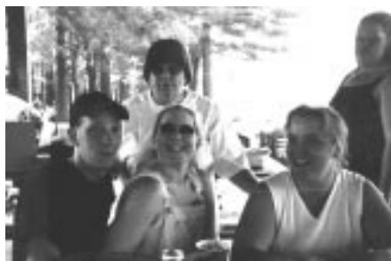
The Holiday Inn, Concord, NH, held its annual summer outing July 2nd at Elmwood State Park. Swimming, baseball, horseshoes, burgers and hot dogs made for a great day. We even got our GM out of the office to relax!

room. We will showcase our "new" hotel by hosting the Concord Chamber of Commerce "Business After Hours" in December.