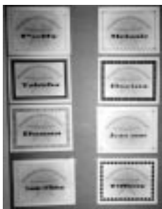
The Days Inn, Keene, NH, has instituted a new "Hospitality Achievement Award" program. Employees are nominated by guests to receive the award for going "above and beyond the call of duty." As you can see from the

photo, there are some shining stars in Keene!