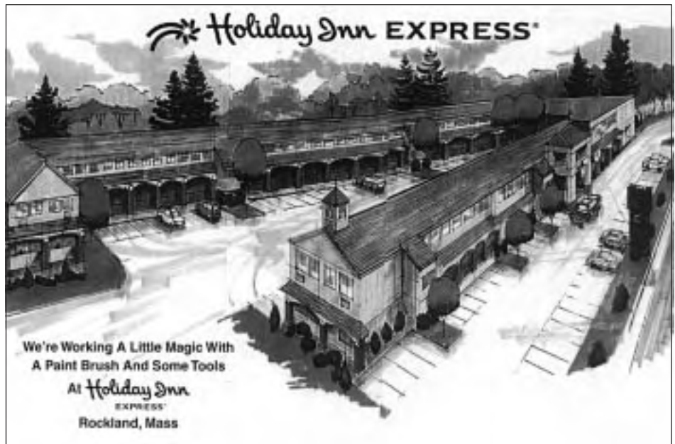
Renovations at the Holiday Inn Express, Rockland, MA.

In addition to being completely refurbished, guest rooms now have in-room movies, Nintendo, voice mail, irons/full-size ironing boards and easily-accessible dataports.