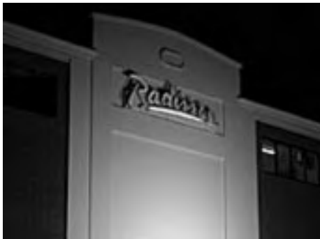
A new look for the Radisson Hotel, Williamsport, PA.

The Best Western Inn & Suites, Rutland, VT, completed renovations