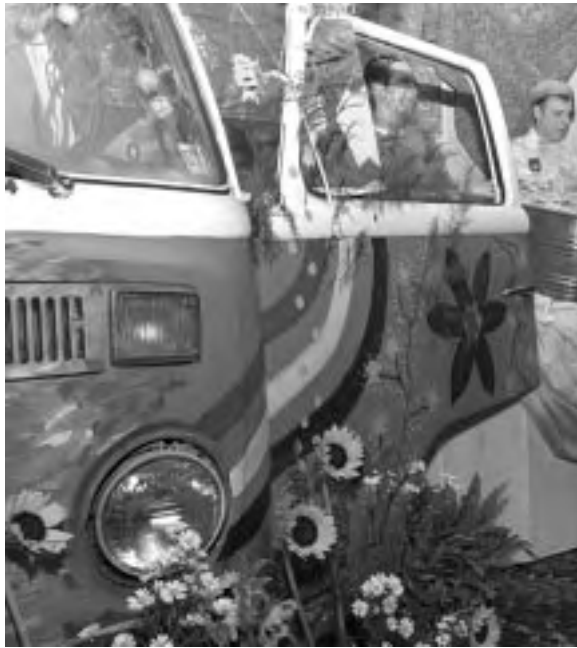
Everything was "groovy" at the Psychedelic Dine-In hosted by the Radisson Hotel, Williamsport, PA.

The Radisson Hotel Corporation encourages promotions, including Family Magic, Bed & Breakfast and Business Class. Rewards for every stay are encouraged; there is a "gold points network" at Radissons, in which guests earn points at over 1,500