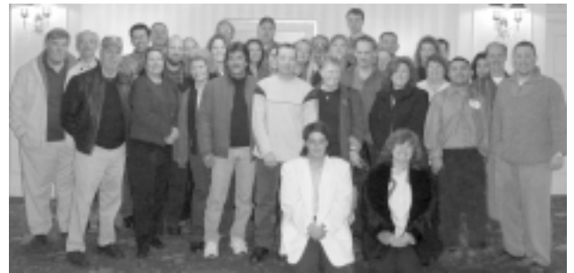
Group photo from Engineering and Housekeeping Workshop

A main focus of this year's workshop for the engineers was the assembly of a Preventative Maintenance (PM) book for each property. The book consists of forms and checklists that allow the engineers to schedule and track the essential preventative maintenance of the hotels' mechanical systems. Heaters, pumps, ice machines, kitchen equipment, air conditioning units – in short, all the hotels' equipment and PM needs – are listed in this book. The "PM book" is an indispensable tool for properly maintaining the hotels' equipment and is a valuable timesaving and organizational tool. "Participants came away with a renewed sense of the importance of Preventative Maintenance," Dennis said.