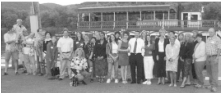
Radisson staff and clients in front of the Hiawatha riverboat

representing such companies as Textron, ShopVac, Frito Lay, David R. Webb, C/S Group