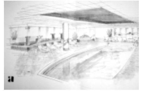
Architectural rendering of the new pool and fitness center at the Holiday Inn, Salem, NH

The Holiday Inn, Salem, NH is getting into the "swim" of things, with the construction of its NEW pool and fitness center! The property began a $600,000 renovation project in April. When completed in late summer, a 4,000 square foot ballroom, which has been underutilized as a storage annex, will be transformed into a pool and fitness center known as "Club Holiday." The indoor space will include: a 36' swimming pool; an eight-person whirlpool spa; a gym with men's and women's locker rooms that feature floor to ceiling mirrors; and rooms for storage and pool equipment. "We are excited to introduce "Club Holiday" to our hotel," said Rob McCarthy, Vice President of Operations. "We hope that it becomes a big draw for visiting groups, families and vacationers throughout the Salem/Andover region."