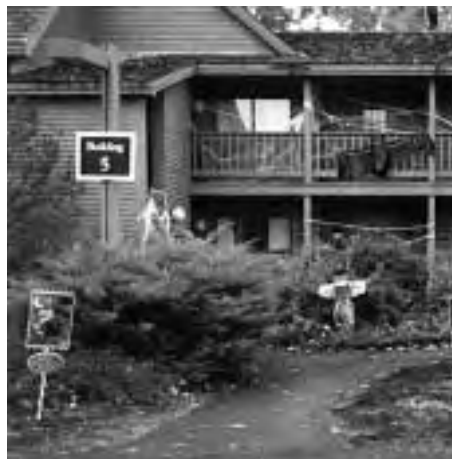
BOO-tification project: The staff of the Best Western Inn & Suites, Rutland, VT, transformed one of the buildings on their property into the haunted headquarters for their Halloween party.