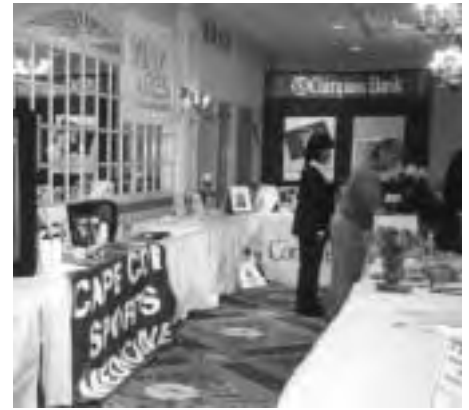
The Holiday Inn, Falmouth, MA hosted the first annual Falmouth Chamber of Commerce Health Fair, titled "A Healthy Mind, Spirit and Soul." More than 35 exhibitors offering services from estate planning to long term health care options participated in the day's events.